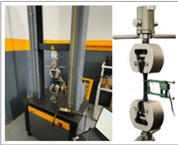
Figure 2. UVE MNR050 tensile test machine.